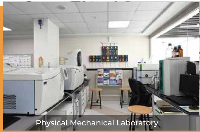
Physical Mechanical Laboratory

(Please get in touch with us at soplab@sies.edu.in for list of tests offered & rates of the same.)