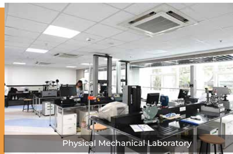
Physical Mechanical Laboratory